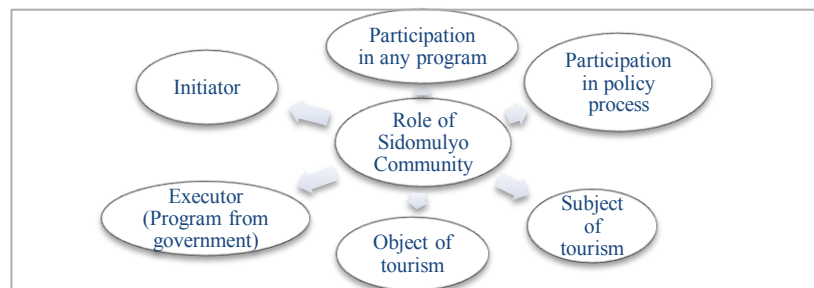
Figure 3 Community's Role in Sidomulyp Tourism Village Development

exploitation of natural resources and cultures of local communities excessively. The level of involvement of local communities in a tourism attraction with another tourist attraction will be different depending on the capabilities of human resources (HR) development of local communities in tourism attraction areas. Based on the results of field research on the various components of the community in the village Sidomulyo have shown the involvement of local communities in planning the development of tourism destinations in the village Sidomulyo. Not only their participation in each activity and the policy making process, the role of Sidomulyo community also evident from their efforts as the subject of tourism is to do things well in order to contribute to the tourism village development. At the community level, active participation is an important element in the formulation of development plans in order to raise confidence and develop a sense take responsibility for the results of community-based tourism development.