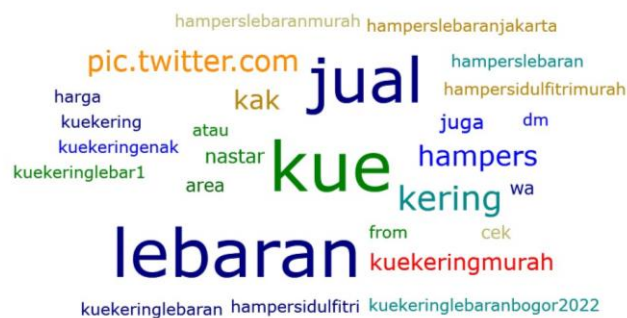
Figure 3: Word Clouds about Jual Kue lebaran ATLAS.ti output that has been processed by researchers

Furthermore, based on the word cloud analysis, several popular words in the tweet were obtained, as presented in Figure 3: