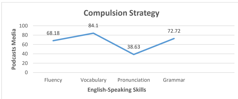
Picture 1. Compulsion Strategy

In choosing a compulsion strategy and a podcast media, there are different frequencies in improving English-speaking skills (fluency, vocabulary, pronunciation, and grammar). The elements of vocabulary got 84.1 percent, grammar was 72.72 percent, and fluency was 68.18 percent had similarities percentage which indicate supporting of using compulsion strategy and podcasts for teaching English-speaking skills. However, pronunciation element was the lowest percentage by 38.63 percent which proves that it is too difficult to be improved by students in this study.